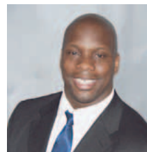
Kaliym Islam Depository Trust & Clearing Corporation

The Depository Trust & Clearing Corporation (DTCC) selected Sealund to create five Interactive Learning Courses available online for its participants. One of the requirements for this training initiative was a quick turn around time. Sealund had to meet the challenge of completing all five courses in under four months!